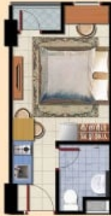
Studio Nett: 18,77m 2 | Semi Gross: 22 m 2