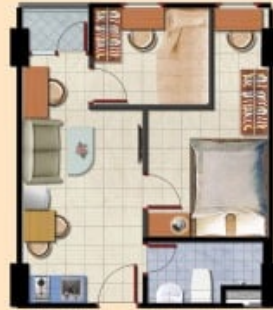
2 Bed Room Nett: 32,98 m 2 | Semi Gross: 39 m 2