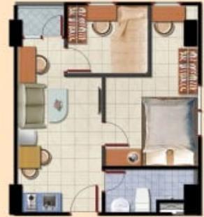
2 Bed Room Corner Nett: 34,77 m 2 | Semi Gross: 42 m 2