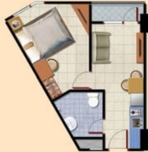
1 Bed Room Nett: 26,51 m 2 | Semi Gross: 34 m 2